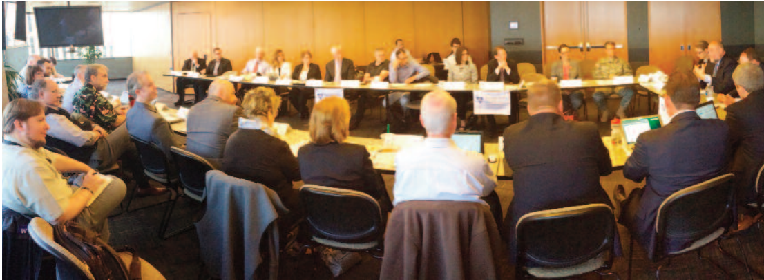
Cybersecurity roundtable discussion, Seattle, WA.