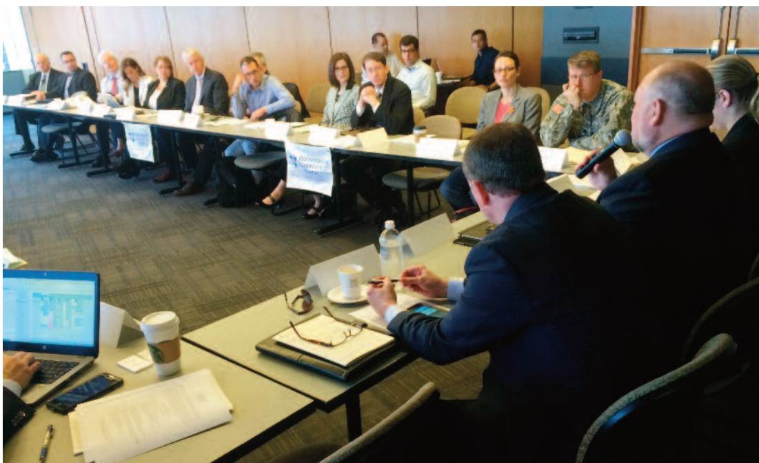
Cybersecurity roundtable discussion, Seattle, WA.

This report is meant to lay the groundwork for key leaders' and policymakers' careful consideration. The information provided herein is generally reflective of the opinions voiced at the PLC meeting (and by the survey respondents). However, any given statement should not necessarily be viewed as consensus.