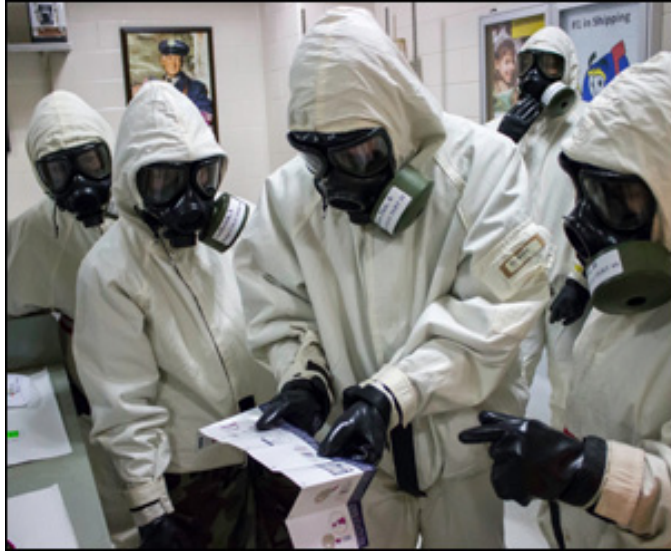
Identification of live agents at the Chemical, Ordnance, Biological, and Radiological (COBRA) training facility.

to transfer agents safely to the bays for training sessions. The nerve agents and biological materials require that students and personnel take extra precautions for personal safety and health. The personal protective equipment and the M40 masks in use protect against the live biological materials (i.e., ricin and anthrax) and chemical agents (VX and GB) encountered during the course.