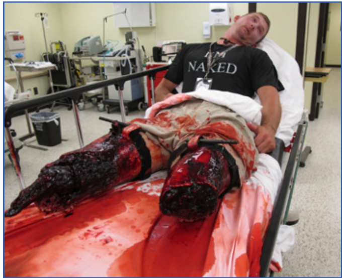
Called "Legs," this simulation device provides students practice in managing amputee survivors.

Throughout the Integrated Capstone Event, an onsite emergency operations center observes the activities, monitors other hazards such as weather and information alerts, and releases situational updates. Students are completely immersed in the environment with the use of moulaged role players and mannequins to represent various types of injuries resulting from a particular scenario. The exercise control center monitors the actions of the students and injects new situations as needed, including gunshots, bombs, patient noises (screaming, yelling), phone calls, sirens, and media reports or newsbreaks. In addition, the training exercise manager can increase or decrease the pace of the exercise. Once the exercise is concluded, all students gather in an open forum for an after-action report to evaluate what was done right or wrong, to share challenges faced, and to discuss lessons learned during the exercise.