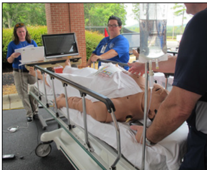
Integrated Capstone Event at the Noble Training Facility.

The COBRA Training Facility houses the only civilian training courses in the United States that use toxic agents, which include VX (chemical nerve agent, contact hazard), GB (chemical nerve agent, vapor hazard), nonpathogenic ricin (biological hazard), and nonpathogenic anthrax (biological hazard). This training includes standard triage techniques for responding to weapons of mass destruction, which means that students must learn to perform immediate extractions and make rapid decisions in a high-intensity situation. Outside on the COBRA grounds, Northville is a small-town simulated setting – including a school, a pizza parlor, and a police station – that serves as a hazardous materials scene. Although no toxic agents are present in Northville, injects such as agent simulants that alert test kits, smoke, lighting, and other special effects may be added to change the scope of training to more authentically simulate real-life scenarios.