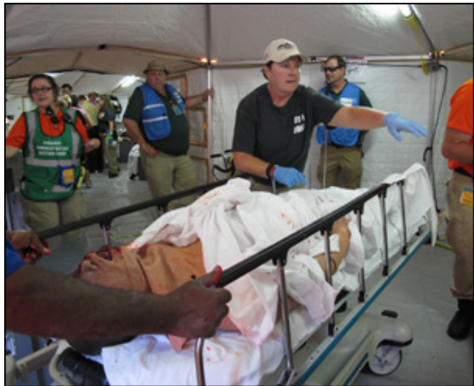
A human simulator during an Integrated Capstone Event in conjunction with National Disaster Medical System (NDMS).

The CDP's mobile training courses (also referred to as nonresident training) help a broader audience to develop effective preparedness skills with mutual aid communities coming together for training. These training programs can also be embedded into police and fire academy training curriculums. Currently, the CDP has training programs embedded in several police academies, including New York City, Chicago, and Los Angeles. In addition, the Atlanta Fire Department sends their trainees to the CDP for two weeks as part of their initial training.