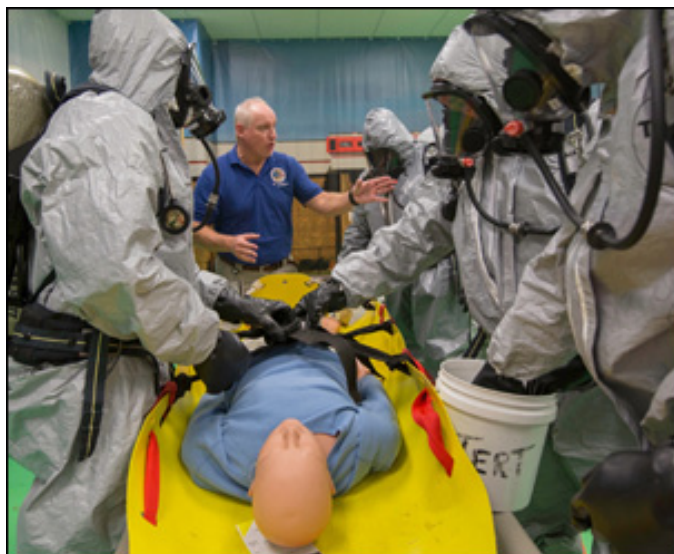
Students learn how to care for victims while maintaining personal safety during the Technical Emergency Response Training (TERT).

The CDP continues to assess needs or gaps in preparedness and training in order to find new ways to serve responder and receiver communities with constantly evolving curriculum. The CDP and subject matter experts develop curriculum based on demand, case studies, and the National Preparedness Goal's core capabilities to identify gaps and training needs. The process from gap identification to training implementation typically takes 60-180 days,