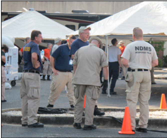
Partner agencies find mutually beneficial ways to share resources with CDP.

Curriculum that is developed at the CDP is available to other training partners such as the NDPC. The established partnerships with members of the NDPC enable the CDP to respond rapidly to emerging threats. Having a budget that has remained flat over the past several years, the CDP always looks for new ways to maximize efficiency and create cost effectiveness through its partnerships, which include: