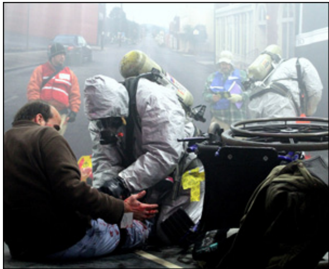
Simulated exercise at the Advanced Responder Training Complex.

In 1998, Congress transferred portions of the former Ft. McClellan Army base property, including a biological and chemical training facility, to the CDP. Since much of the needed infrastructure already existed, the cost savings was approximately $51 million in 1998, which equates to nearly $100 million in today's construction costs. In addition, a 2014 purchase of 94.04 acres of leased property from the McClellan Development Authority at a very reasonable price provided further cost savings for the CDP, freeing budget money to aid other training purposes.