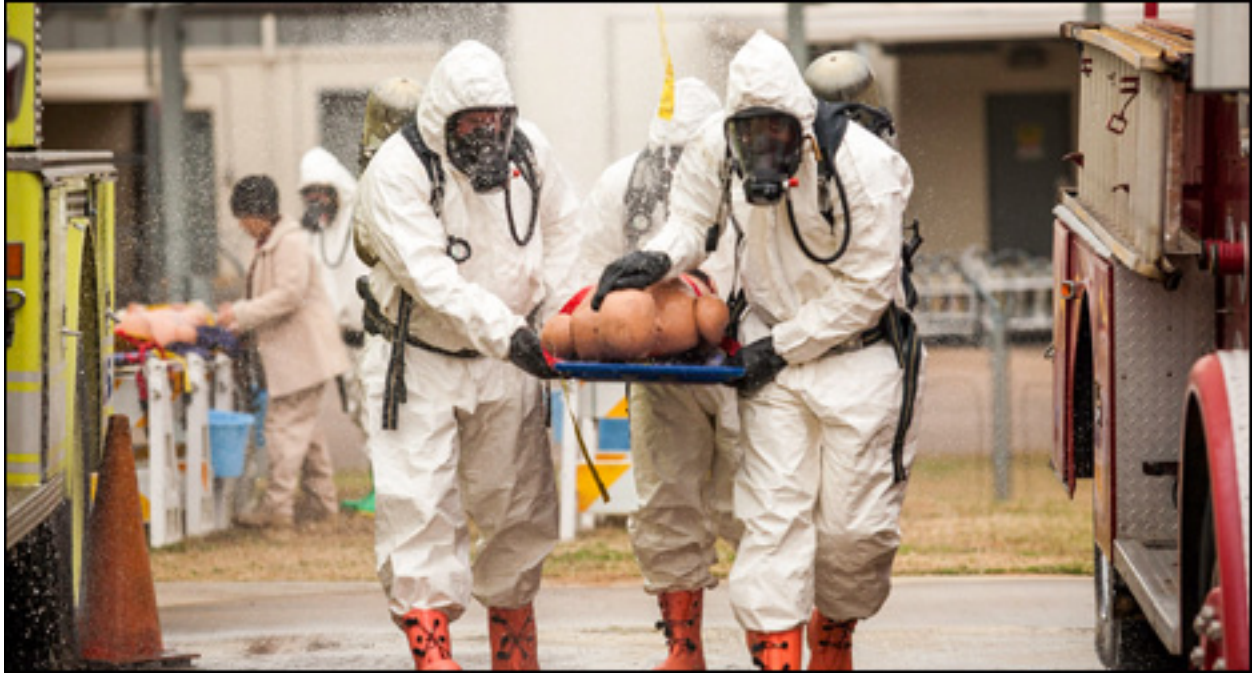
Students participate in simulated decontamination exercise at the Chemical, Ordnance, Biological, and Radiological (COBRA) Training Facility.

The success of the CDP is founded on broad and effective partnerships. Resources from these partnerships feed into the CDP to enhance training efforts and increase the students' learning experience with hands-on experiential-based training.