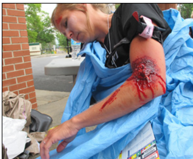
Moulage creates a more realistic environment for students during the Integrated Capstone Event.

Then, in 2014, the Ebola crisis raised the CDP's nationwide training to a new level. The need for training to don and doff personal protective equipment became apparent. There was a noticeable gap in knowledge of and experience in dealing with people who may have been exposed to the Ebola virus. This was especially true of Transportation Security Administration agents, law enforcement officers, first responders, and airport authority staff who greeted passengers arriving from West Africa. In less than two weeks, the CDP developed a new eight-hour course (Personal Protective Measures for Biological Events), the development team performed a walkthrough, the course material was fine-tuned, and instructors were in place to deliver the training.