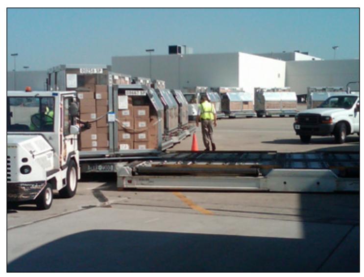
Cargo containers specially designed for SNS products in the stockpile's early years are still in use today. The shape allows for better configuration for air cargo transport.

The one-year mark proved a busy time for the budding stockpile. The program established transportation contracts to move stockpiled assets, if needed, and created its Program Planning, Response and Training Team to work with HHS emergency