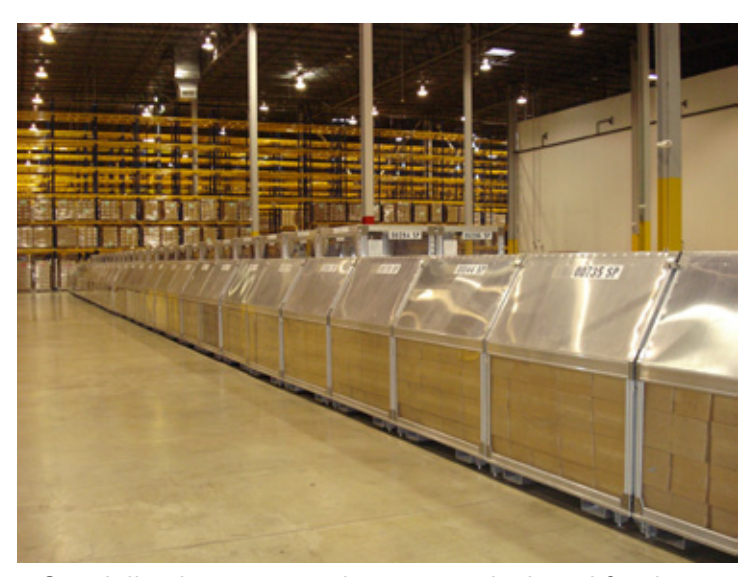
Specialized cargo containers were designed for the 12-hour Push Package to improve delivery speed and efficiency.

On 1 March 2003, the Homeland Security Act of 2002 took effect, and the stockpile was transferred from HHS to the Department Homeland Security (DHS). At the same time, the National Pharmaceutical Stockpile renamed the SNS to reflect its evolving formulary to store more