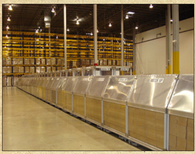
The Early Years: Shaping a National Stockpile for Preparedness By Greg Burel