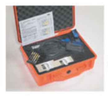
Dräger CDS Kit

The Dräger Civil Defense Simultest Kit has become the industry standard in chemical warfare agent detection for first responders. Two simultaneous test sets measure a wide range of chemical substances including nerve, blood, lung and blister agents. Quick and easy to use, the CDS Kit is virtually maintenance-free with no calibration or batteries required and measurement results take only 5-minutes.